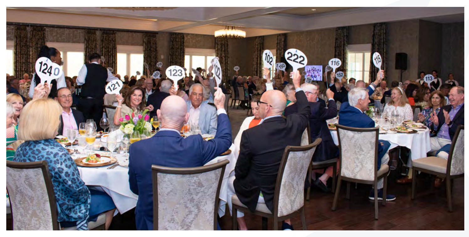
Generous attendees raise their paddles